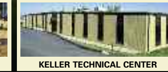
KELLER TECHNICAL CENTER