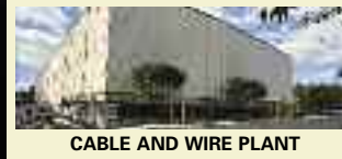
CABLE AND WIRE PLANT