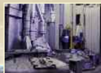
Furnace and Smelter

The company's lead smelter and refinery is a model for the industry recycling virtually 100% of every used lead-acid battery component brought to its facility. East Penn built the battery industry's first acid reclamation plant, avoiding potentially hazardous acid disposal.