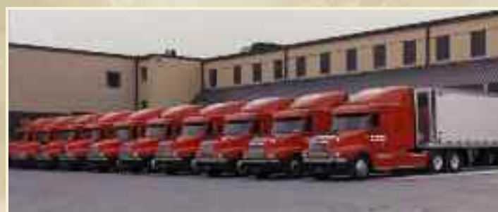
A large truck fleet connects our extensive distribution network

With the industry's leading technical staff and resources, East Penn's engineering team keeps the company at the forefront of battery research and development. East Penn is constantly utilizing the latest technology and equipment to create innovative new products.