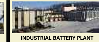
INDUSTRIAL BATTERY PLANT