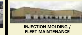
INJECTION MOLDING / FLEET MAINTENANCE