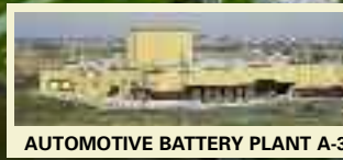
AUTOMOTIVE BATTERY PLANT A-3