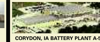
CORYDON, IA BATTERY PLANT A-5