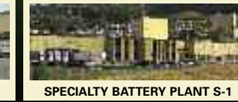
SPECIALTY BATTERY PLANT S-1